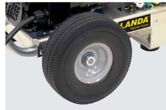
Flat Free Tires