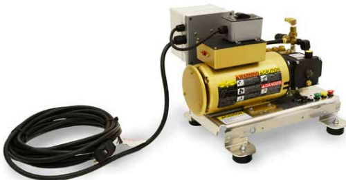
HD 1.8/1350 Ed equipped with Auto Start/Stop shown with optional skid mount feet

■ Illustrated Labels with universal graphics and symbols make operating instructions and warnings easy to understand for operator convenience and owner liability protection.