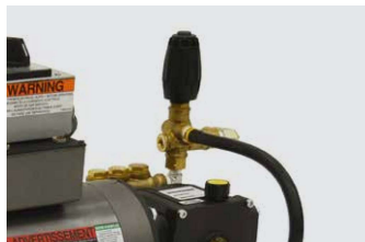
VRT3 with Bypass Loop