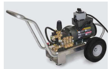
Corrosion Resistant Frame