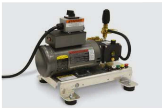
Modular Design shown with optional Skid Mount Feet