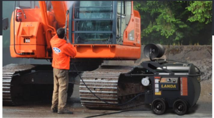
Model HOT4-20024 pictured

Simple and affordable with efficient and reliable high-pressure hot water, this series is designed for ease of operation as well as portability. Match the HOT performance and quality specifications up against any of our rivals, and you will quickly discover the value is undeniable!