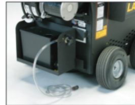
Optional rust-free Float Tank with stainless steel inlet filter, backflow protection and inlet detergent metering valve (8.917-506.0).