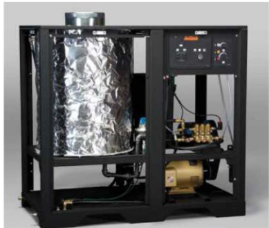
Fully instrumented, the ENG's removable panels allow easy access to components and is available with the optional LanCom Wireless Remote Control.